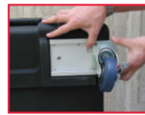
3R2727-27B-E See reference chart for models with available "slide-mount" caster kits