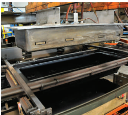
Vacuum mold for keyboard case

In 1997, SKB invested in roto-mold machinery. These molds are ideal for making larger cases and cylindrical cases. The PE roto-mold material starts as a fine powder that is measured according to the size of the case. The material is then sealed up in a multi-piece aluminum mold and fixed on a biaxial rotating wheel. The material is heated at 800° in a very large oven while constantly rotating. The powder melts and coats the inside of the mold and after cooling, the cast is disassembled and the case is removed. Roto-molding is great for providing maximum protection and can withstand maximum impact in transport.