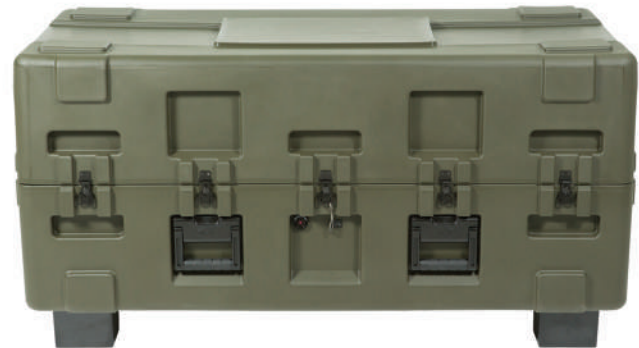
3R5123-23 See reference chart for models with available Forklift Riser Kits